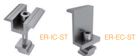
Inter and End clamps

The STIII-A supports are completely pre-assembled, they only need to be unfolded and secured to the foundation. The anodised aluminium alloy profiles are connected with stainless steel fasteners. Furthermore through this new design the legs can be adjusted vertically by 50mm allowing for adjustments in case the foundation requires it. For larger projects the positioning rail clamps can be preassembled**, which means that the rail positions don't have to be measured.